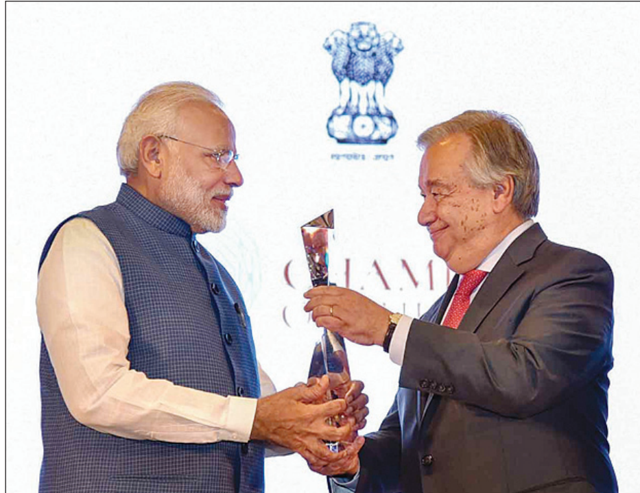
(Prime Minister Shri Narendra Modi receives UN's highest environmental honour 'Champions of The Earth Award' from United Nations Secretary General Antonio Guterres at a special ceremony, in New Delhi on October 3, 2018)

Our country is devoting unparalleled attention to new and renewable sources of energy. Over the last four years, this sector has become more accessible and affordable. The Ujala Yojana has led to the distribution of nearly 31 crore LED bulbs. The costs of LED bulbs have reduced and so have the electricity bills and the C emissions.